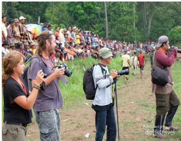
Figure 2. Photographer in the Pacu Jawi area

Not only from local people, but Pacu Jawi also gains interest from domestic and international tourists, particularly to photographers. Recognizing the high interest, the event organizer initiated a photography competition as part of the festival. Such an initiative is a form of adaptive strategy to meet the needs of contemporary time while still preserving the essence of the culture.