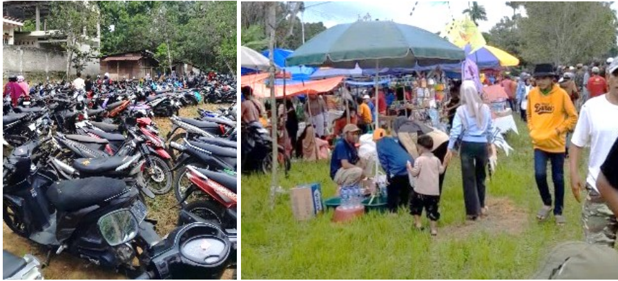
Figure 4. Parking and trade/culinary area