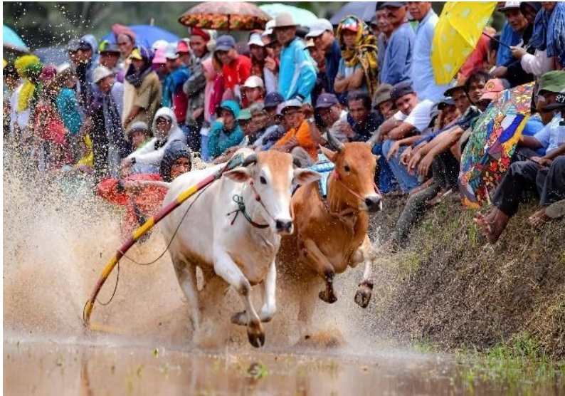
Figure 6. Visitor's view of the spur

Physical and visual aspects showed a duality that refers to Pacu Jawi as an authentic cultural practice, yet it has not fully been adapted to the demands of modern tourism. The high score of landscape authenticity (4.45) and traditional equipment (4.62) confirmed the significance of physical elements in forming perceptions of authenticity. The infrastructure, for example, was very simple, with only wooden grandstands or even without the grandstands, where people only gather around the racing area. This discomfort in the audience area (3.59) reveals a trade-off between authenticity preservation and accommodation of modern visitors' needs.