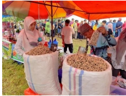
Figure 7. Fried peanuts or roasted peanuts are considered the signature souvenirs of the Pacu Jawi event.

experiences to attract visitors. This shows the complexity in assessing the perspective from local versus outsiders. For the locals, the food offered at the event is not seen as a unique point because it has been part of their daily consumption, although some visitors come to enjoy the food instead of the race. This indicates that Pacu Jawi has been seen more as local entertainment rather than a tourist attraction. Regarding souvenirs, there are no special handicraft products associated with Pacu Jawi. People commonly just buy roasted peanuts to be carried home.