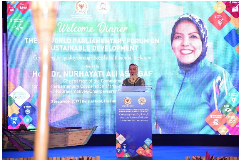
Figure 2. A personal photo (of the committee chair) was displayed in the Opening Session event of the World Parliamentary Forum 2019

candidates is considered a more effective way of campaigning, thus no wonder that poster of legislative candidates would be filled with pictures and close-up face of the candidate, along with the name of the party and number to be voted. Today in Indonesia, it is not uncommon, even after (or prior) the election, to see faces of ministers, chairpersons of the DPR committees, and organizations will appear in a public banner like this Figure 2 below.