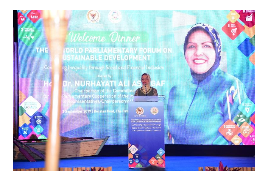
Figure 2. A personal photo (of the committee chair) was displayed in the Opening Session event of the World Parliamentary Forum 2019

candidates is considered a more effective way of campaigning, thus no wonder that poster of legislative candidates would be filled with pictures and close-up face of the candidate, along with the name of the party and number to be voted. Today in Indonesia, it is not uncommon, even after (or prior) the election, to see faces of ministers, chairpersons of the DPR committees, and organizations will appear in a public banner like this Figure 2 below.